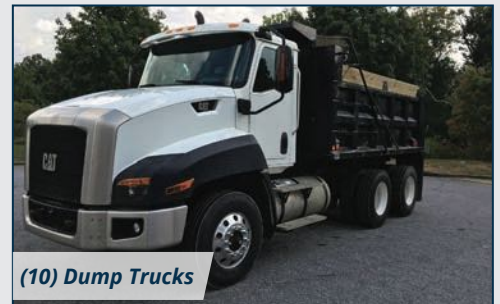
(10) Dump Trucks